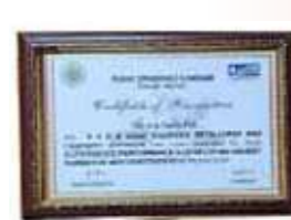
Best Supplier NPD FY20 by Rane Madras