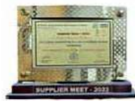
Best Supplier NPD FY20-22 by ZF Rane