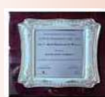
Best Supplier NPD & Ramp up FY21 by Automotive Axles