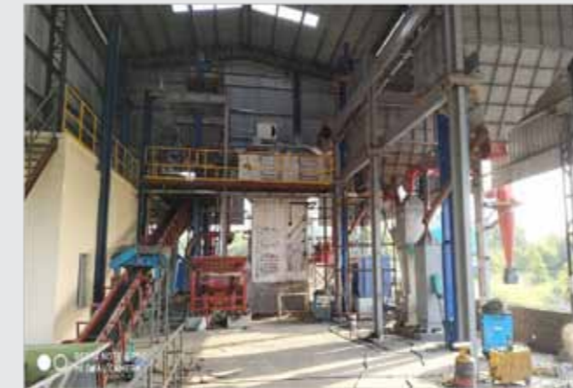
Make: Rhino Capacity: 3 TPH. Qty: 1 no.