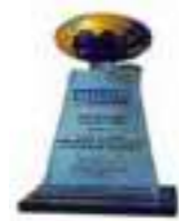
Best Supplier Delivery FY20-22 by Rane Madras