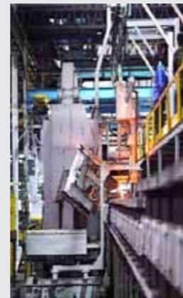
Make: DISA Flex 70 HPML Cake Size: 900 x 700 x 250 / 250 mm Prodn Capacity: 20 Moulds/hr. Qty: 1 No.