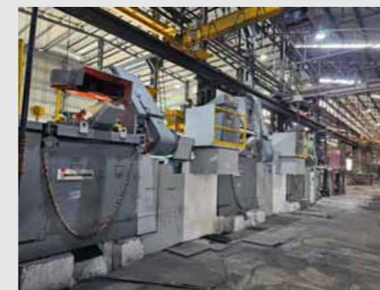
Make: INDUCTOTHERM Capacity: 1750 kW - 1 Ton x 3 crucibles 3750 kW - 1 Ton x 3 crucibles 850 kW - 1 Ton x 2 crucibles