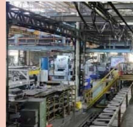
Make: SINTO HPML Cake Size: 508 x 660 x 200 / 200 mm Prodn Capacity: 100 Moulds/hr. Qty: 2 No.