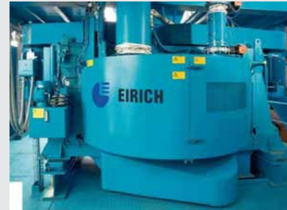
Make: Eirich Mixer Model: RV-19 Sand Mix Tons/hr: 26. Qty: 2 nos.